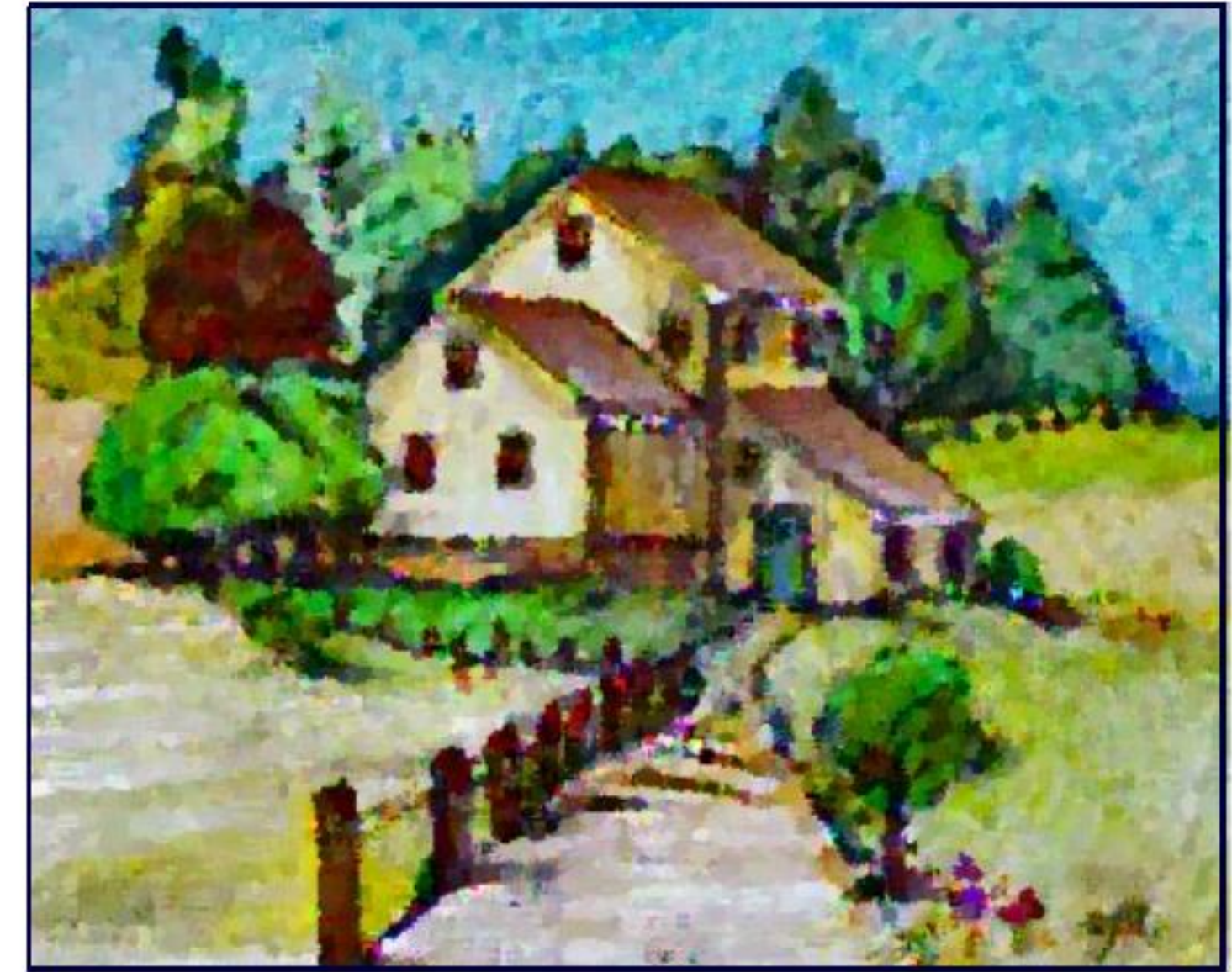
" Inspecting is more than a skill, it is an art "

QUALITY INSPECTIONS performed in accordance with NACHI and New York State Standards of Practice, and to the highest code of ethics